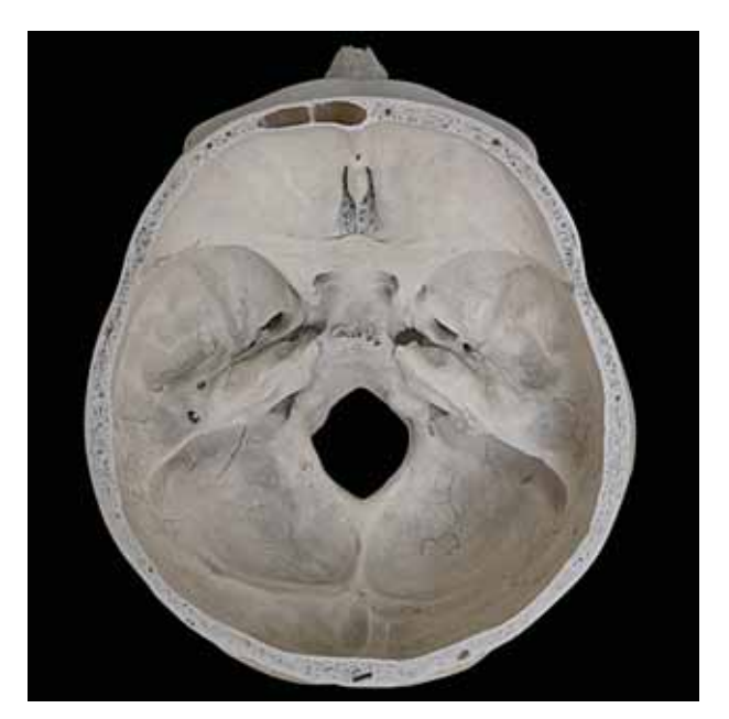
Picture 4. Cranial base - occipital symmetry with right temporoparietopetalia

D In all the cases of anteroposition of the occipital part of the skull, as well as temporal bone pyramid, posterior fossa of the skull shows anteroposition on the same side. The middle cranial fossa, accoding to its position in the middle of the skull, as well as its relation with sphenoid bone, shows great difference with respect to posterior fossa. The middle fossa corresponds to the appearance of the occipital part in 47 % of all the examined specimens, and the anterior fossa in 70 %.