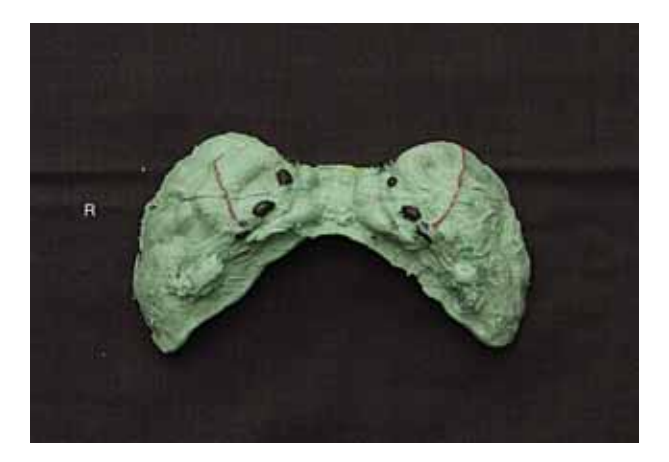
Picture 5a. Alginate imprint of middle cranial fossa at left occipitopetalia

by triple rotation of the temporal bone pyramid, which with its growth dictates brahicefalic tendency of human skull development. Vasilije Nikoli} and Pavao Rudan 1971 - 1972. (2) emphasize the importance of cranial base flexion and in connection with that the torsion of the pyramid and the whole temporal bone. Schonemann concluded that the whole configuration of the cranial base depends upon the changing structure and position of the temporal bone. Knauer - 1914. said (1) that the upright position of human being influences configuration of pyramid and skull. Nikoli} and Rudan - 1970.(2,3) accent that the flexion of cranial base causes upright position of human being. Delattre and Ferart - 1951. prove that the flexion of skull - base leads to the descent of posterior cranial fossa, which follows the change in vertebral column position and sphenoid angle increases. According to Delattre and Fenart - (1960) thus brain receives new space for its development. Process of cranial base flexion