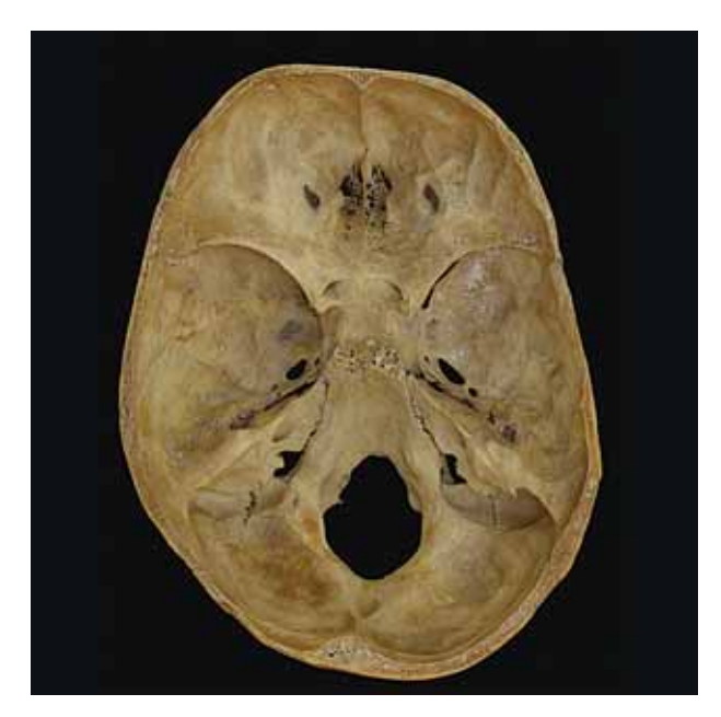
Picture 6a. Alginate imprint of middle cranial fossa at right occipitopetalia

by triple rotation of the temporal bone pyramid, which with its growth dictates brahicefalic tendency of human skull development. Vasilije Nikoli} and Pavao Rudan 1971 - 1972. (2) emphasize the importance of cranial base flexion and in connection with that the torsion of the pyramid and the whole temporal bone. Schonemann concluded that the whole configuration of the cranial base depends upon the changing structure and position of the temporal bone. Knauer - 1914. said (1) that the upright position of human being influences configuration of pyramid and skull. Nikoli} and Rudan - 1970.(2,3) accent that the flexion of cranial base causes upright position of human being. Delattre and Ferart - 1951. prove that the flexion of skull - base leads to the descent of posterior cranial fossa, which follows the change in vertebral column position and sphenoid angle increases. According to Delattre and Fenart - (1960) thus brain receives new space for its development. Process of cranial base flexion