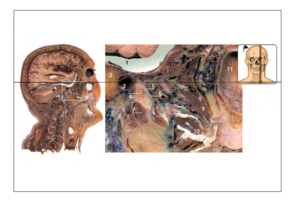
Figure 4. Cartilaginous part of the auditory tube; sagittal section, medial view, magnified 1.5-x. Middle cranial fossa (1), petrous part of temporal bone (2), internal carotid artery (3), medial lamina of cartilaginous part of auditory tube (4), lateral lamina of cartilaginous part of auditory tube (5), membranaceous lamina of cartilaginous part of auditory tube (6), levator veli palati muscle (7), tensor veli palati muscle (8), lateral pterygoid muscle (9), medi-

Base of pterygoid process (1), accessory tubal cartilages (2), lateral lamina of cartilaginous part of auditory tube (3), medial lamina of cartilaginous part of auditory tube (4), lateral pterygoid muscle (5), pharyngeal orifice of auditory tube (6), medial pterygoid muscle (7), levator veli palati muscle (8), tensor veli palati muscle - outer part (9), tensor veli palati muscle - inner part (10).