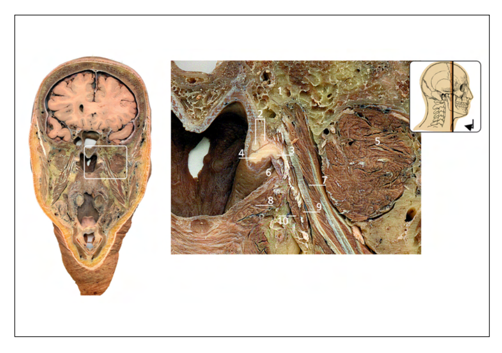
Figure 3. Pharyngeal orifice of the auditory tube and its relation to the levator and tensor veli palati muscle; frontal section, anterior view, magnified 1.5-x.

Base of pterygoid process (1), accessory tubal cartilages (2), lateral lamina of cartilaginous part of auditory tube (3), medial lamina of cartilaginous part of auditory tube (4), lateral pterygoid muscle (5), pharyngeal orifice of auditory tube (6), medial pterygoid muscle (7), levator veli palati muscle (8), tensor veli palati muscle - outer part (9), tensor veli palati muscle - inner part (10).