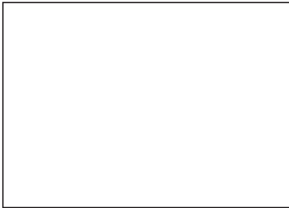
Picture 1. Cross section through the endarterectomized segment of the coronary artery: the intima is diffusely and concentrically atherosclerotically involved. The diffuse mononuclear infiltrate is visible as well as neoangiogenesis in the outer parts of the intima. (x25)