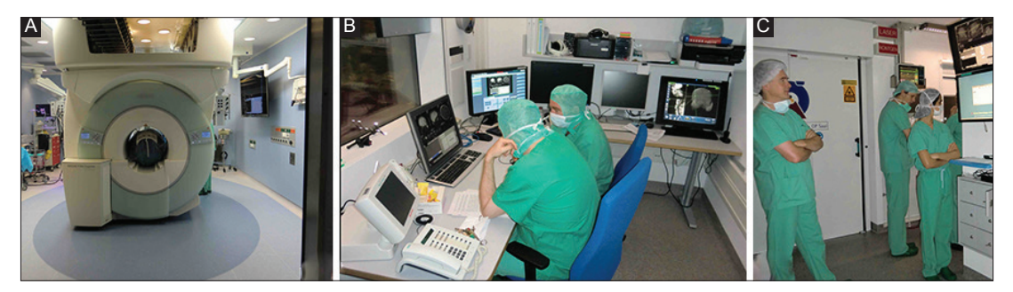
FIGURE 1. View from the MRI scanner bay into the OR showing the back side of the MRI scanner (A). The completed iMRI unit consists of an OR (51m<sup>2</sup> excluding the MRI scanner bay) The control room contains the MRI consol and the satellite station as well as the IGS planning station and a touch screen control for the multimedia unit (B). Two separate monitors were installed for the surgical team in the waiting area allowing the team to view MRI images as they are acquired. In the background next to the OR door the anesthesiological workstation (C).

For the preoperative scans, no draping of the patient was necessary. The intraoperative scans were acquired using the procedure described above; however, the patient had to be covered with a sterile plastic bag for an intraoperative scanning, (Figure 3 A) to keep the surgical field sterile. The upper part of the head coil was then placed on top of the covered patient and fixed in position, using only a Velcro band. Three employees measured the exact height and position of the OR table with the patient on it so that the patient's head could be placed in the isocenter of the MRI scanner bore