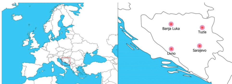
FIGURE 1. Samples were collected from four geographically representative different regions in BH (right): Livno, Banja Luka, Tuzla and Sarajevo.

Kit (Qiagen, Germany), and the product of extraction was later used for further analysis, while the rest of the samples were used for virus isolation on various cell lines at the VFS (data not shown here). The presence of SARS-CoV-2 in the samples was confirmed by real-time RT-PCR using HKU protocol [6], and the cycle threshold (Ct) values were 17.1; 21.3; 24.6; and 20.4 for Livno, Banja Luka, Tuzla and Sarajevo samples, respectively.